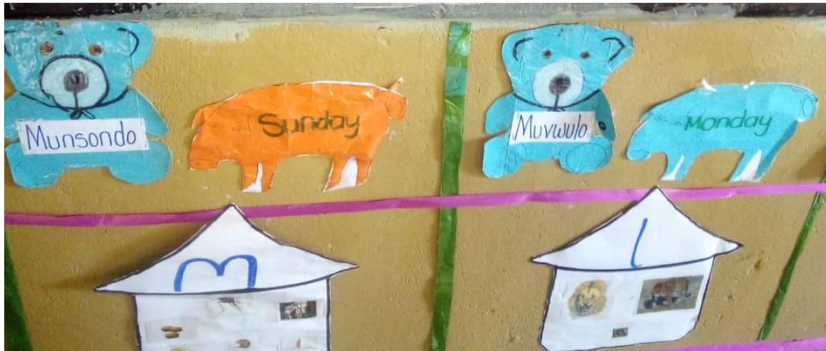
Figure 1: Days of the Week in Chitonga

In figure 1, the teacher asked the learners on what they could see on the picture, and they responded in different languages which existed in the classroom. The responses included: